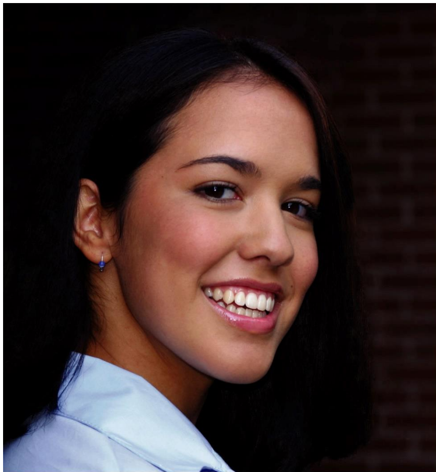
R. J. Class III Skeletal – moderate crowding, midface deficient